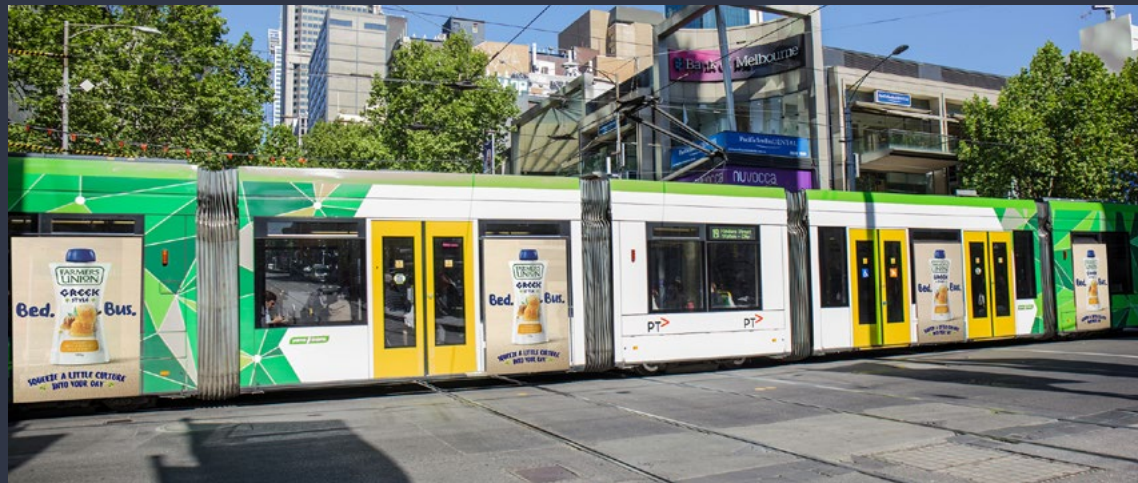
NO TRANSPORT ADVERTISING