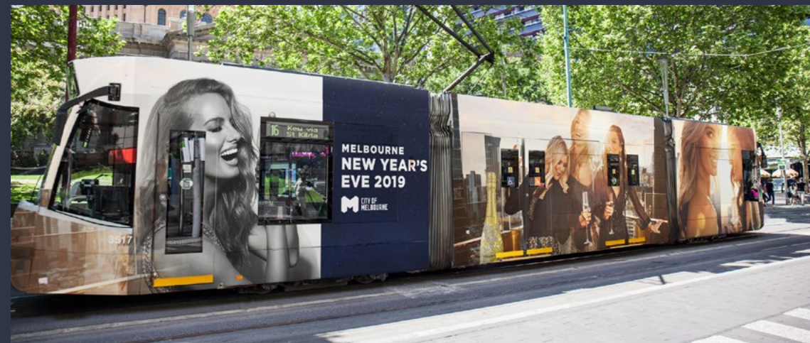
NO INDIRECT ALCOHOL ADVERTISING